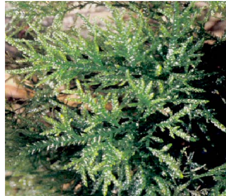
Camptochaeta subporotrichoides LEMBOPHYLLACEAE Mt. Ginanlajan, Brgy. Lake Duminagat - 1620 masl