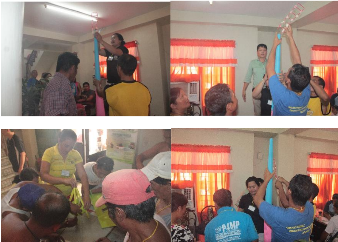
Photos showing the participants constructing their respective towers

During the Leadership Training, the Participants were given an opportunity to lead and to interact with their members. One of their activity was “Tower Construction”. In this activity, each group will build a tower. A tower that is tall where each members could experience the height of the Paris’ Eiffel tower and the strong foundation of the Pyramid of Egypt. The activity was facilitated by For. Pito.