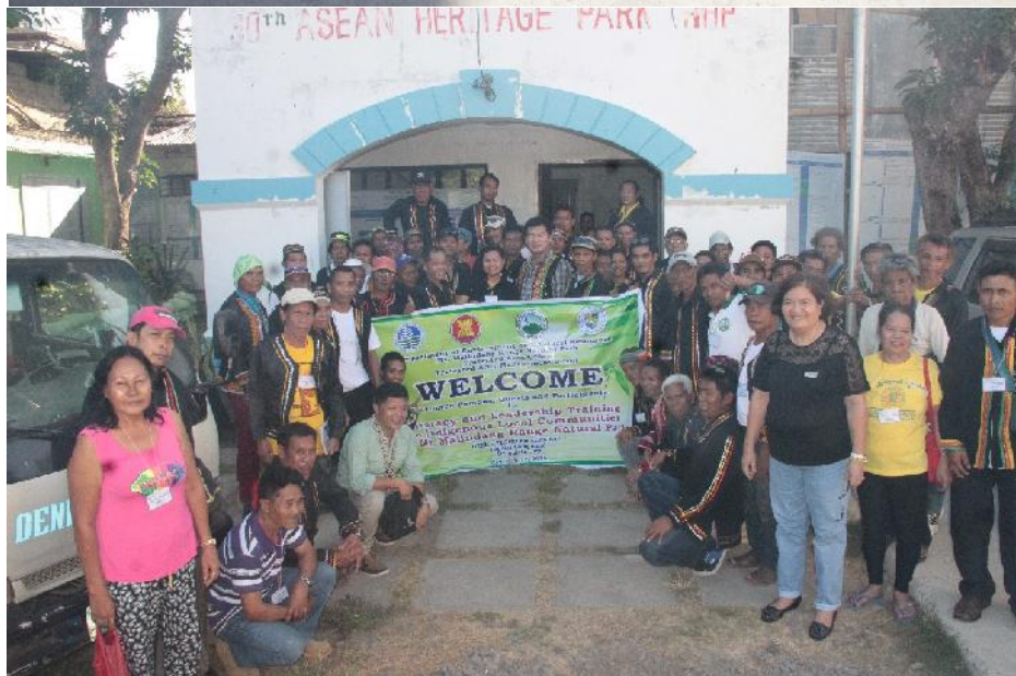
Photos showing the successful participants of the activity