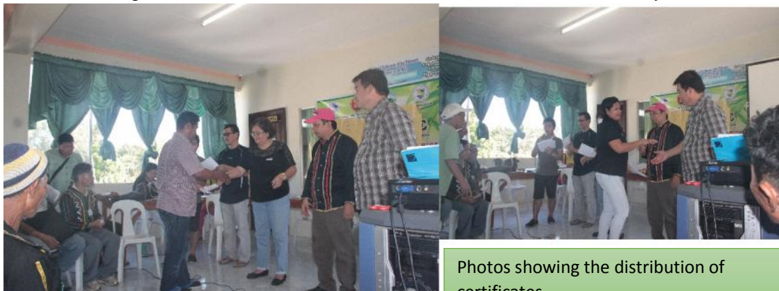
Photos showing the distribution of certificates.