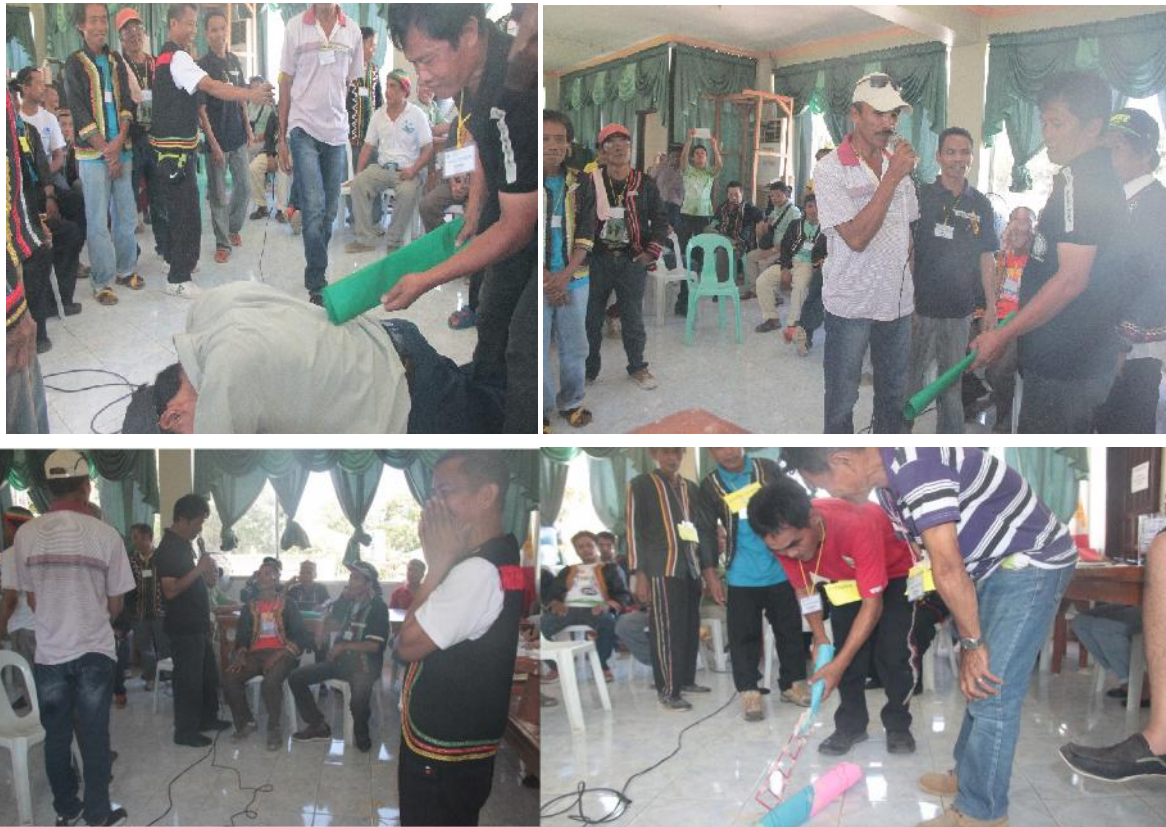
Photos showing during the role playing.